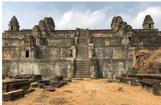
Conservation of the 10th-Century Temple of Phnom Bakheng at Angkor Park, Cambodia.

In KIIs, DOS respondents articulated the foreign policy goals to which AFCP grants were supposed to contribute, but the goals sometimes differed from those noted in the applications. Respondents were able to explain how projects logically contributed to foreign policy goals, but few were able to provide measures of how AFCP projects have helped achieve the goals. The anecdotal examples respondents were able to provide related to employment creation, increasing tourism revenue, or demonstrating partnership with host countries. No respondents mentioned systematic monitoring of foreign diplomacy goal achievements. Respondents offered some