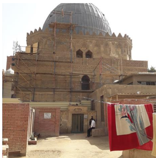
In Egypt, view of the al-Imam al-Shafi'i Mausoleum's dome, which had been cleaned as part of the restoration.

Challenges for grantees included difficulty in understanding the Systems for Award Management (SAM) and Dun and Bradstreet Number (DUNS) registration requirements; language barriers; exchange rate fluctuations between the local currency and U.S. dollar; financial issues (e.g., reporting, disbursements, budget inflexibility); grant size; and length of